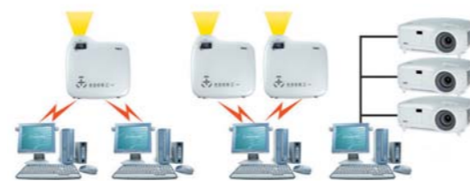
Thanks to ImageXpress Utility 2.0, you have a great deal of flexibility when structuring your own network. The same is true, by the way, when you need to control a number of LTs from one PC.

The LT280 or LT380 will soon be indispensable in your network. Both use an integrated RJ45 terminal and the innovative ImageXpress Utility 2.0 software. These high-tech components even let you integrate the new LTs into a multiply segmented network. Incorporate one or more projectors. Access one, two or many LTs from one or more PCs. Whatever configuration you choose: the new software helps you identify and register network projectors as well as control and administrate their functions.